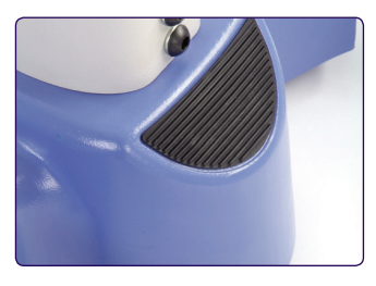
Foot 'push pad' helps reduce the force needed to initiate forward movement.

This view is shared by our clinical consultant team, who have assisted us in conducting detailed usability surveys to ensure the Stature meets the true needs of the patient, carer and the environment in which it operates.