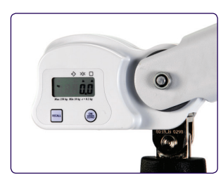
Digital weigh-scale (Class III)