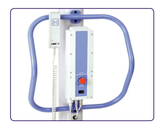
Over-sized push handle for improved handling and manoeuvrability.